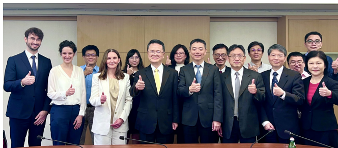
Taiwan-Canada IP Policy Dialogue Meeting

In December, the 4th Taiwan-Canada IP Policy Dialogue Meeting was held in Taiwan. Both sides exchanged opinions on and discussed the following topics: “Experience and Outcomes in Digital Transformation,” “Patent Grace Period,” and “Promoting IP Awareness.” TIPO also participated in the 20th Canada-Taiwan Economic Consultations (CTEC).