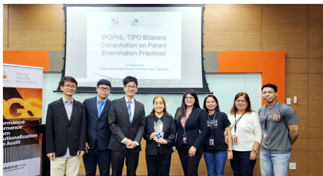
TIPO- IPOPHTL Patent Examiners Exchange

In May, TIPO dispatched three patent examiners to the Philippines to exchange thoughts on examination practices in the fields of electronics, semiconductors, and design patents.