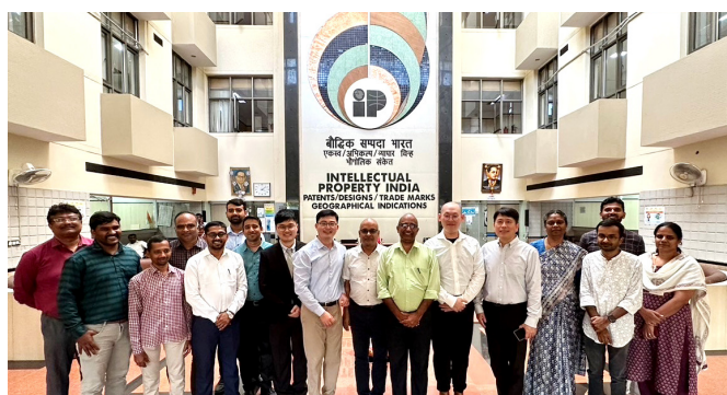
TIPO-CGPDTM Patent Examiners Exchange

In December, TIPO dispatched four patent examiners to India to exchange opinions on patent examination practices in the fields of chemistry and artificial intelligence.