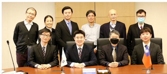
TIPO-KIPO Working-Level Meeting

In January, the 5th working-level meeting with the Korean Intellectual Property Office (KIPO) was held in Taipei. The two offices exchanged views on trademarks and designs and shared recent developments. KIPO also shared recent developments in its AI utilization on examination practice.