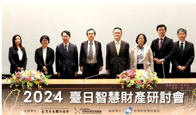
2024 Taiwan-Japan Intellectual Property Symposium

In February, TIPO held the 2024 Taiwan-Japan Intellectual Property Symposium with Taiwan-Japan Relations Association and the Japan-Taiwan Exchange Association. Experts from both sides shared and exchanged views on topics such as the protection of digital designs under Japan's Design Act, the relationship between the metaverse and design patents, case studies on the use of design patent rights in Japan, and the judicial practice of design patents in Taiwan. The symposium attracted over 140 participants from the industry, government, and academia.