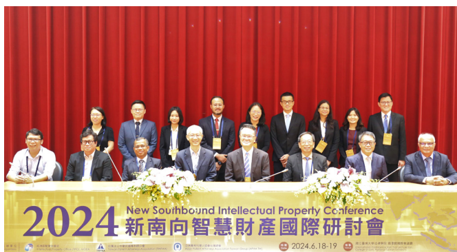
2024 New Southbound Intellectual Property Conference

In June, the 2024 New Southbound Intellectual Property Conference was held, where official representatives from the intellectual property offices and patent industry elites from Malaysia, the Philippines, Thailand, Vietnam, Singapore, Indonesia, and India were invited to attend. The conference provided an in-depth analysis of the latest developments and practices in the patent systems of these countries, with over 210 participants from the industry, government, and academia.