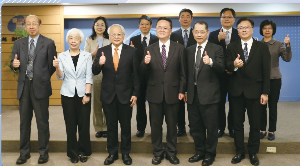
80 th Anniversary of the Patent Act – Masters Seminar Series

A well-developed patent system enhances national technological advancement and drives industrial growth. As such, the Patent Act, enacted in 1944, serves as the legal foundation for an effective patent system. TIPO's monthly IPR Journal published a special feature in celebration of the 80 th anniversary of the enactment of the Patent Act, providing a retrospective on the evolution of Taiwan's patent regime. Additionally, a Masters Seminar Series was organized to commemorate this milestone.