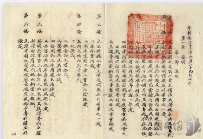
The Patent Act was officially enacted in 1994.

1994 Adoption of international priority rights