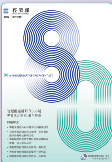
Patent Act 80 th Anniversary special feature in IPR Journal.

2022 Implementation of the patent linkage system