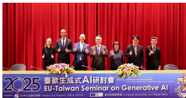
2025 EU–Taiwan Seminar on Generative AI

In March, TIPO co-hosted the 2025 EU–Taiwan Seminar on Generative AI with the European Economic and Trade Office (EETO) and the European Business and Regulatory Cooperation (EBRC). Public and private sector experts from both sides were invited to share and exchange views on AI and copyright issues, including the EU AI Act, global trends in copyright legislation, and the practical developments and challenges of generative AI. The seminar attracted over 180 participants from industry, government, and academia.