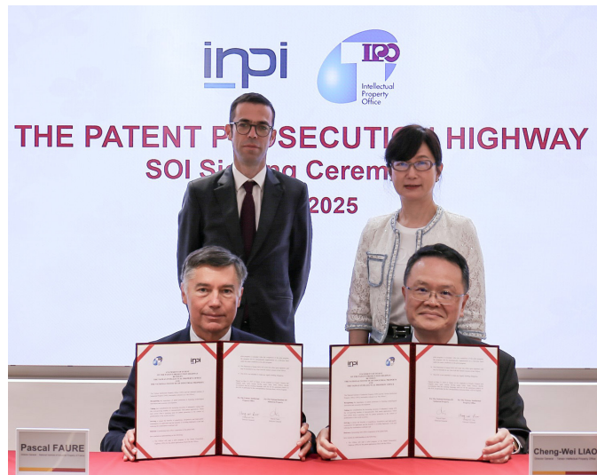
Signing Ceremony of the MOU on the Taiwan–France PPH