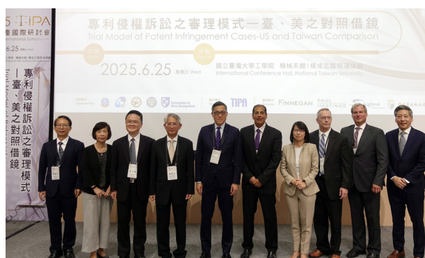
2025 TIPA International Symposium

In June, TIPO hosted the 2025 TIPA International Symposium, themed "Trial Model of Patent Infringement Cases: US and Taiwan Comparison," inviting judges from the U.S. Court of Appeals for the Federal Circuit, experienced U.S. patent litigation practitioners, U.S. academic experts, and domestic experts and scholars. Through keynote speeches and mock U.S. Federal Circuit trial, the symposium explored adjudication models for patent infringement litigation, attracting a total of 315 participants from industry, government, academia, and research institutions.