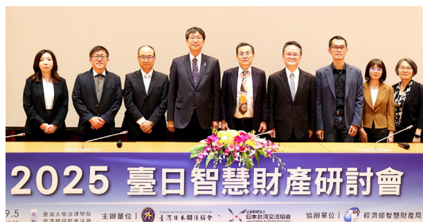
2025 Taiwan–Japan Intellectual Property Symposium

In September, TIPO held the 2025 Taiwan–Japan Intellectual Property Symposium with the Taiwan–Japan Relations Association and the Japan–Taiwan Exchange Association. Focusing on the legal systems and practices of patent infringement litigation in Taiwan and Japan, the event invited public and private sector experts to share the latest developments from both governmental and corporate perspectives, as well as enterprises' challenges and strategies in responding to patent infringement. The symposium attracted over 160 participants from the industry, government, and academia.