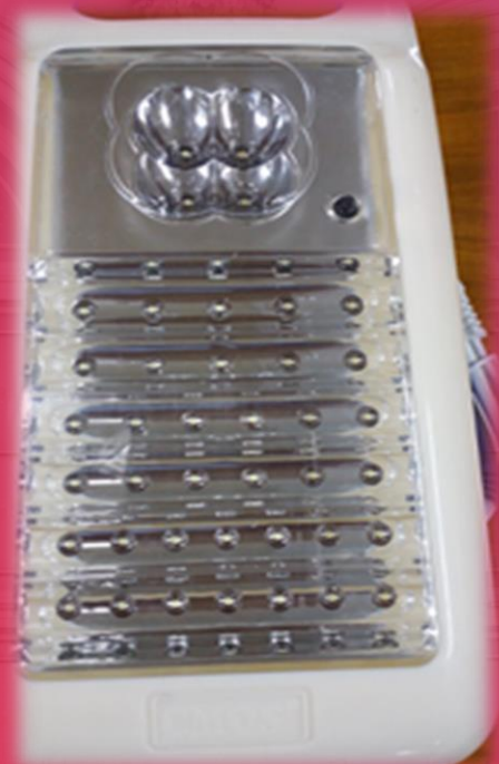
Unregistered Industrial Design