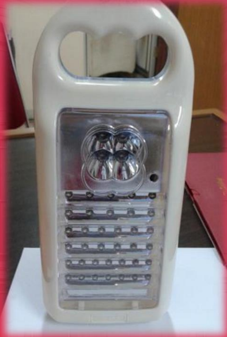
Registered Industrial Design