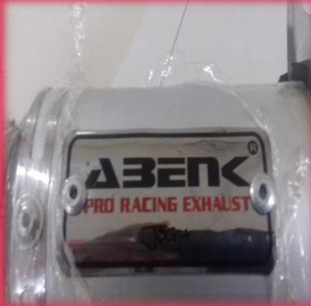
Registered Exhaust Trademark