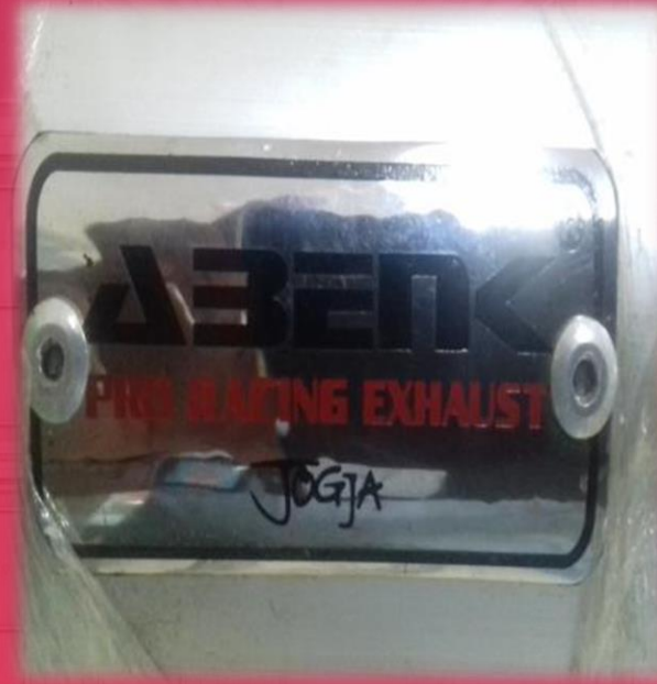
Counterfeit Exhaust Trademark